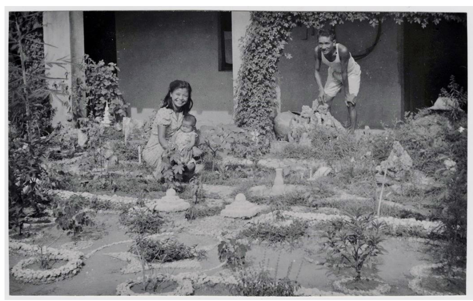
Figure 4. Deoli, India, Miniature Garden. 65

Another shows pebbled patterning around plants, a smiling girl and baby, and an onlooker on the veranda (Figure 4). The ICRC noted 230 rock gardens – which labour alleviated depression, they thought.<sup>64</sup> These culturally inflected gardens challenged the punitive environment's overall banality enabling collective resilience and group cohesion. Internment gardens were an exceptional, temporary phenomenon sprouting across the war's broader carceral landscape, including in Australia and North America, and not only amongst Japanese internees but also the Italian POWs who built altars and grottos in India.