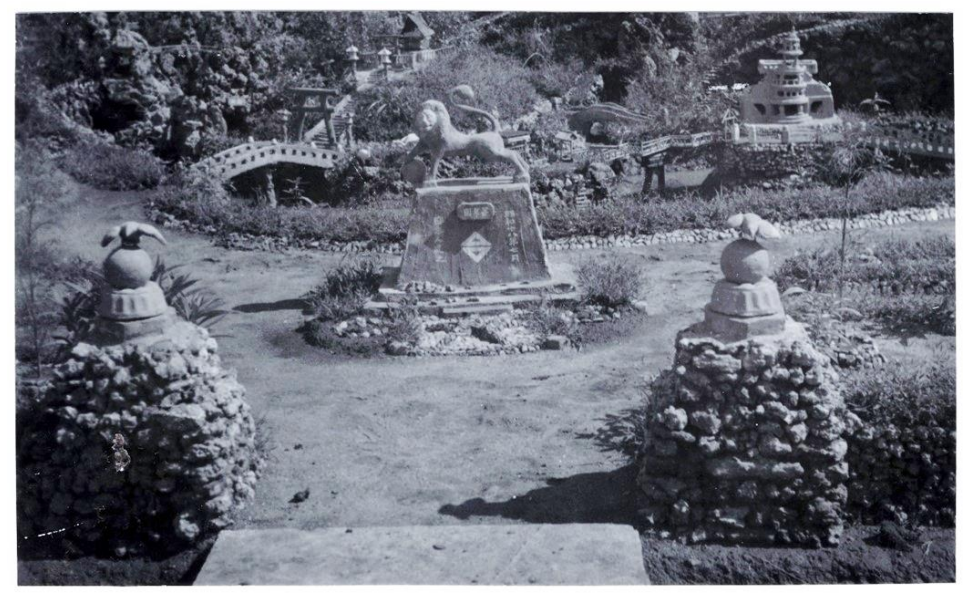
Figure 3. Deoli – India, Miniature Garden. <sup>63</sup> The pedestal is inscribed on the right with Shōwa 18-nen 8-gatsu (Year 18 of Shōwa period (the era of the contemporary emperor – 1943), July) which was built by Japanese. The inscription under the lion mentions 'garden'.

Official correspondence boasts of a well-run establishment; an excellent climate from October to April, and an 'outstanding' increase in gardening activity, not only around the barracks, but in a large plot outside the camp. A variety of flowers and vegetables were judged and awarded prizes at the camp horticultural show. There was fishing in the nearby lake, educational classes for adults and children and sewing groups run by the Camp Commandant's wife. In fact, Fua's second painting of a floral garden makes more sense given this depiction of Deoli. The detailed individual flowers he depicted suggest the minute practices of care and diversion, entirely different from Japanistic landscapes and military shrines. They countered the intolerable ennui and austerity and were created in each locality with materials at hand. A photograph in the ICRC collection shows an entrance to a military building with a statue of a lion poised before a miniature garden with bridge and pagoda (Figure 3).