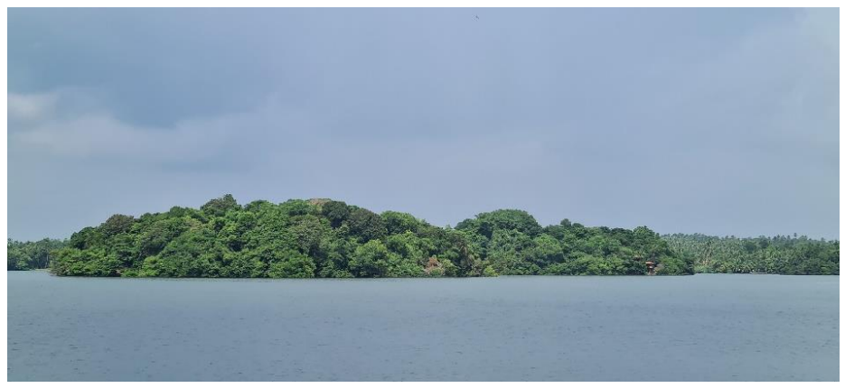
Figure 5. Polgasduwa Island.

Moved there from Ceylon's Diyatalawa camp, after Ceylon was declared a security zone, Ñānatiloka Thera, spent the war at Premnagar internment camp. The first Continental European to be ordained as a monk, he had travelled in Burma and Malaya before setting up the Polgasduwa Island Hermitage, in southern Ceylon in 1911 (Figure 5). The Hermitage was dedicated to the study of Theravada Buddhism and attracted a consistent flow of Western converts as well as some among the marginalised Rodiya. Ñānatiloka was arrested and interned during the First World War, initially in the Hermitage and later at Ceylon's Diyatalawa Camp (Figure 6) before transportation to Australia's Liverpool Camp and then to Trial Bay Prison, both in New South Wales. By the time of his second internment at Diyatalawa Camp during the Second World War, he and his four German disciples distrusted the British.