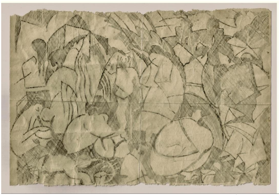
Figure 1. Fua Haribhitak, Sketch of the Japanese internees at Purana Qila.<sup>3</sup>

A crowd of anonymous figures, many of them women in brightly coloured kimonos carrying or holding onto children, huddle together in an enclosed space. Their bodies curl inward as if warding off some unseen evil, the repetitive geometric patterns amplifying their distress. The background silhouette is of Humayun's Gate at Delhi's Old Fort.