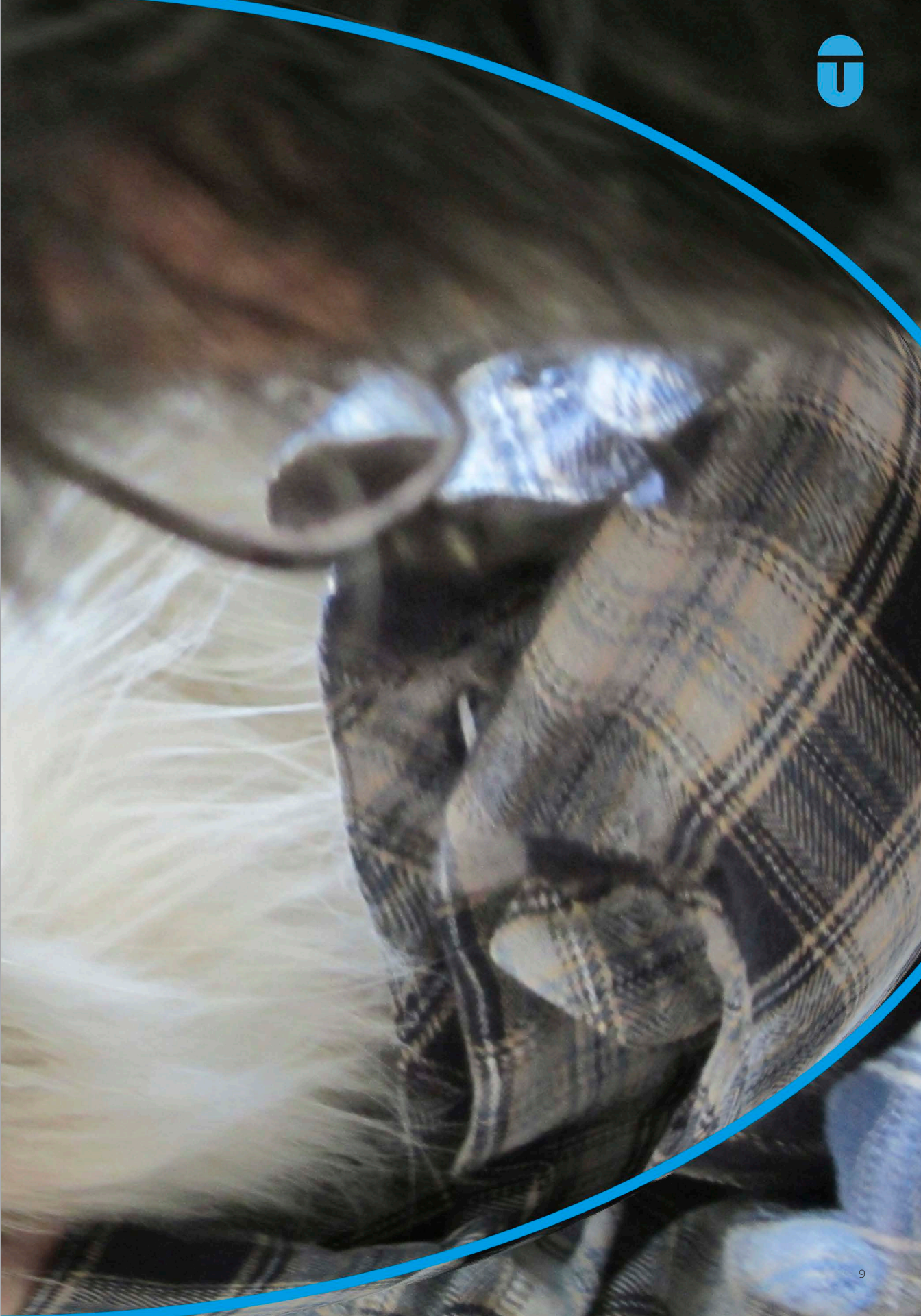
NSA: No Speaking Aloud, Anonymous, 2013.